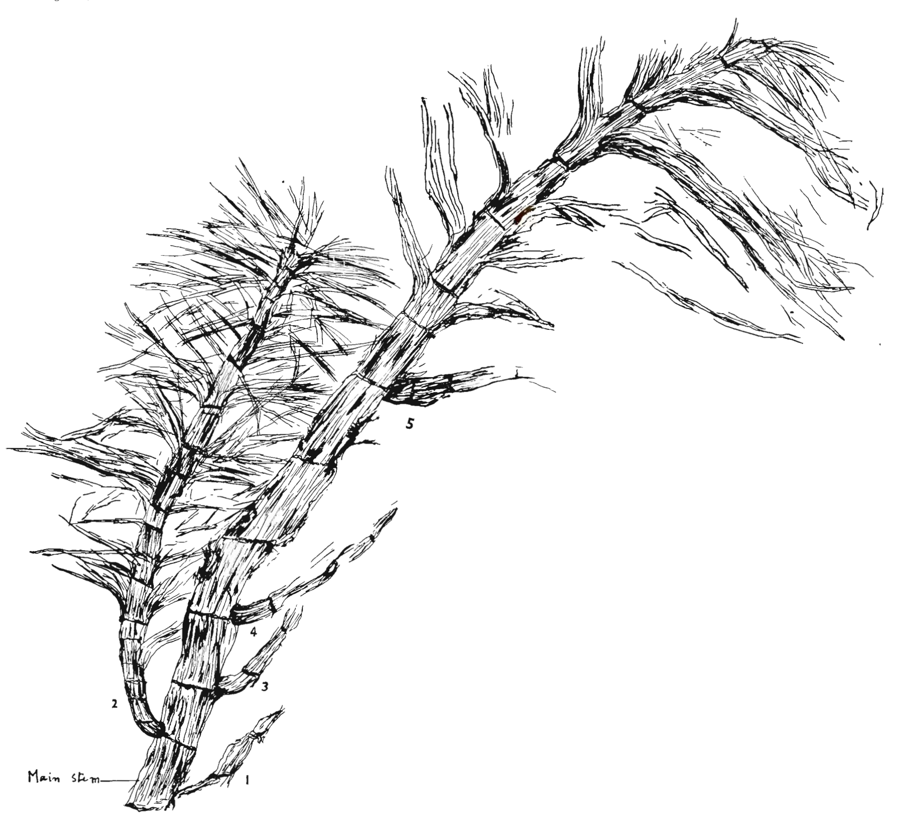
Text-fig. 1 — Phyllotheca ampla sp. nov., showing strongly ribbed main stem with 5 lateral branches and leaf sheaths towards the upper end, the branch number 2 showing its attachment with the main stem. \times 1.