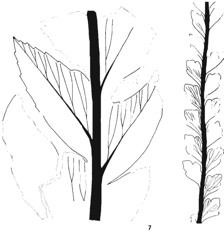
TEXT-FIGS. 7-8 — 7. Cladophlebis kathiawarens sp. nov., showing venation. No. 32311. \times 5 . 8. Sphenopteris sp., showing venation. No. 32587. \times 4 .

alternate, linear, two alternating pairs of pinnae arising close to one another, the pair above them appearing at a distance of 3.5-4 cm. Pinnules alternate—subopposite, falcate, emerging at an angle of 80^\circ from the rachis, free but lower basal margin of each pinnule slightly decurrent. Margin entire near base, crenulate or dentate near apex. Mid-rib prominent proximally, faintly discernible at apex. Secondary veins emerging from mid-rib at an angle of \pm 45^\circ , constantly once forked swept near apex undivided. Apex acute. Lower most pinnule of each pinna arising on basiscopic side slightly away than the others, smaller than the other pinnules, deltoid, placed closer to the main rachis from where pinna arises, nearly at right angle or slightly reflexed downwards.