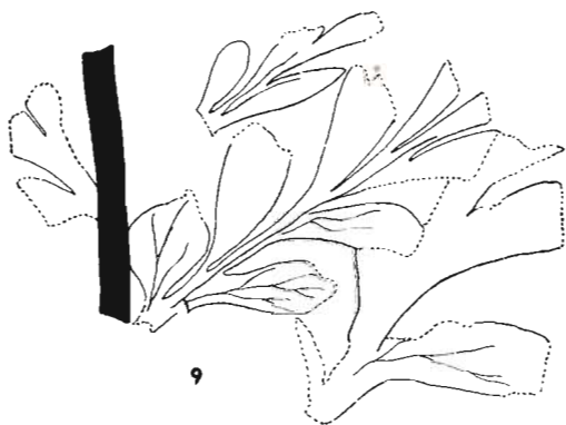
TEXT-FIG. 9. — Sphenopteris specifica (Feistm.) comb. nov., showing venation. No. 32627. \times 4 .

1876 — Pachypteris brevipinnata Feistm., p. 33, Pl. 3, Figs. 7-7a, Pl. 4, Figs. 1-3; Pl. 12, Fig. 2.