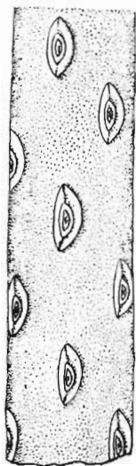
TEXT-FIG. 2 — Stem of Cyclo dendron lesliei Kräusel with leaf scars.